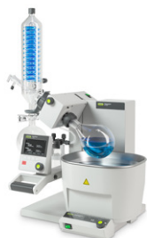
Rotavapor® R-300 Convenient and efficient rotary evaporation