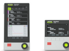
Interface I-300 / I-300 Pro Convenient process regulation and monitoring