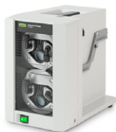
Vacuum Pump V-300 The economical and silent vacuum source