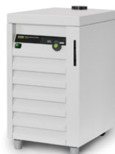
Recirculating Chiller F-305 / F-308 / F-314 The efficient and water saving way of cooling