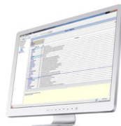
LIMS Software Interface Automated result data management