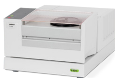
NIRFlex® N-500 Versatile laboratory FT-NIR spectrometer