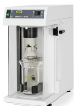
Mixer B-400 Grinding and homogenization