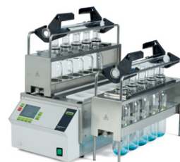
SpeedDigester K-439 / K-425 / K-436 IR digestion