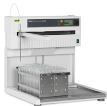
Fraction collector C-660 Fraction collection