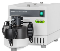
Pump Module C-601 / C-605 Pump