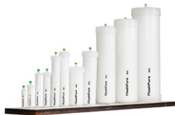
FlashPure Cartridges Get the most out of your flash purifications