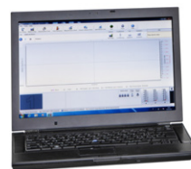
SepacoreControl Software Full control software