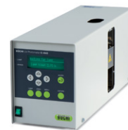
UV-Vis Detector C-640 UV-Vis detection