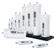
Sepacore® Flash cartridges Prepacked columns