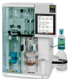
KjelMaster K-375 Steam distillation and titration