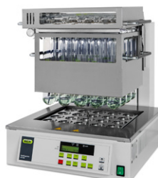
KjelDigester K-446 / K-449 Block digestion