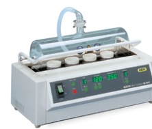
Wet Digester B-440 Incineration