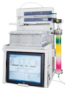
Sepacore® X10 / X50 Flash chromatography system